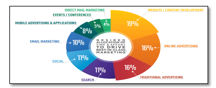
Fig-1: Various channels of pharmaceutical promotions