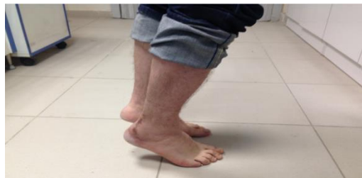
Image-5: The patient was able to rise to the tip of the toes on the 6th postoperative month

the first year, the AOFAS score was 77 and painless full ankle ROM with good triceps surae muscle strength was detected. The patient could rise to the tip of his toes (image 5). At the end of the second year the AOFAS score increased to 86.