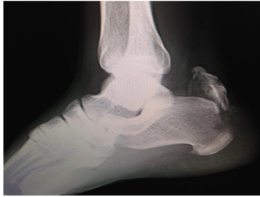
Image-1: Multi-fragmented and displaced calcaneal tuberosity fracture

A large multi-partial avulsed fragment was seen on the image, and CT was performed (image 2).