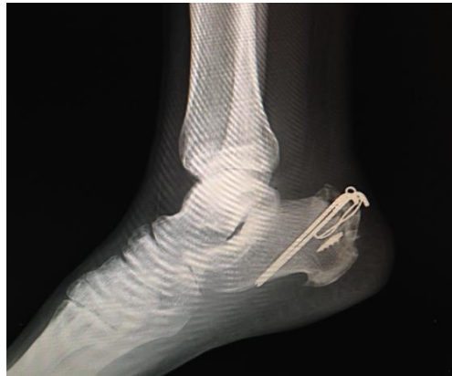
Image-4: A satisfactory healing in the lateral ankle graph at the twelfth postoperative week

removed and passive ankle movements were initiated. At the twelfth week, radiological union was observed and active ankle movements could begin (image 4).