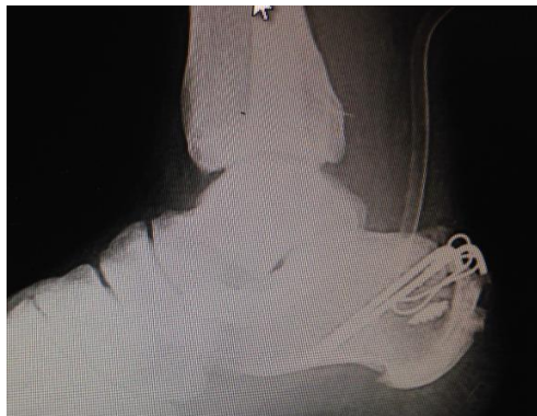
Image-3: Satisfactory anatomic reduction can be seen on the first postoperative day

The fracture was stable, and the passive ankle dorsiflexion and stability were not impaired. The crumbled bone fragments were fixated to the main fragment by using anchor spines. The plane was imaged with a scope and found to be suitable. The skin was closed, and the ankle was wrapped in long leg plaster in neutral (image 3).