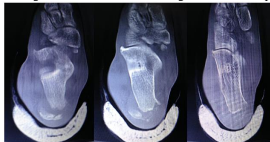
Image-2: Axial CT image of the ankle. An atypical multi-fragmented calcaneus avulsion fracture

A large multi-partial avulsed fragment was seen on the image, and CT was performed (image 2).