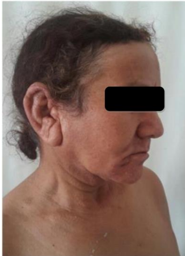
Fig-1: Clinical appearance directly prior to initiating treatment with melphalon and corticosteroids – skin thickness decreased, papules became less visible