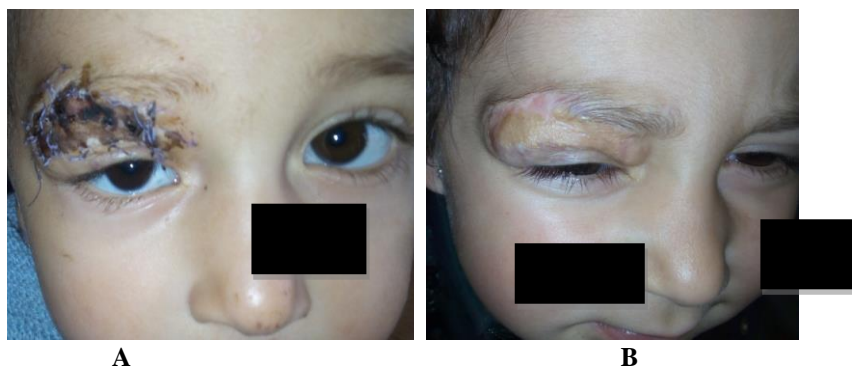
Fig-3: palpebral hemangioma Treatment for 2 Years old infant. (A) Day 14 post skin graft placement; (B) healed palpebral lesion 2 months post graft.