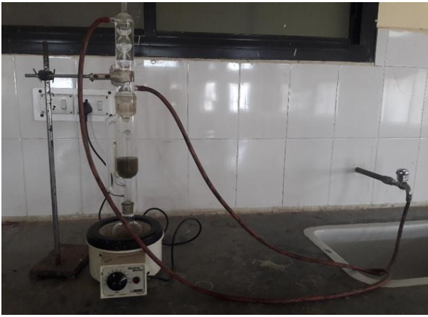
Fig-1: Extraction of gymnemic acid using soxhlet apparatus

Extraction was proceed into two steps are shown below