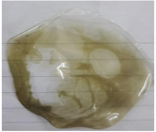
Fig-4: Herbal Transdermal Patch of Gymnema sylvestre Determination of Absorption (λ max)

The herbal gymnemic acid patches were bear sustained release formulation but it's not determined the time and rate of drug delivery model for topically gymnemic acid.