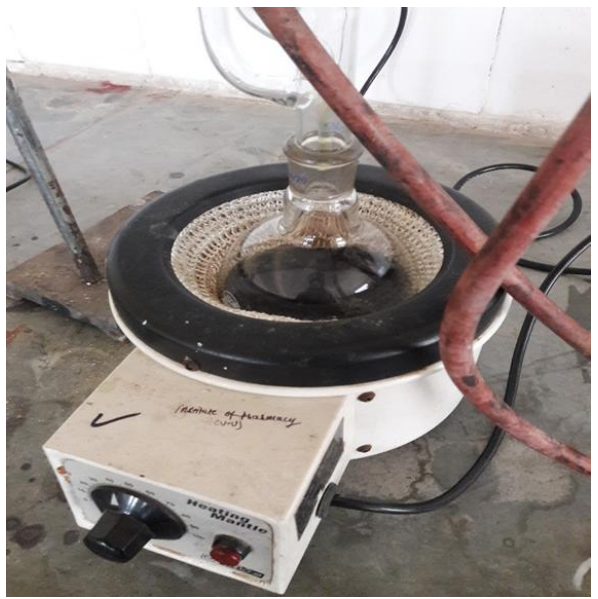
Fig-2: Collected extracted in round bottom flask

50gm of dried leaves powder of gymnema sylvestre was taken from market these plant material treated with 90% of methanol of 200ml added in soxhlet apparatus for continuous hot extraction process, within maintained temperature of 50 to 60°c extracted upto 6-8 hours. Then, after extraction further distilled it from simple distillation method for 3-4 hours and 5gm of thick paste was obtained.