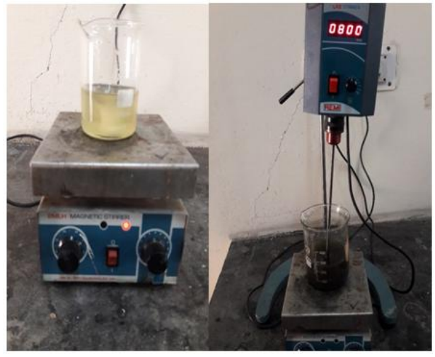
Fig-3: Magnetic stirrer and Mechanical shaker using to prepared suspension of drug polymer

The obtained suspension was agitated using mechanical stirrer up to 400 - 800 revolution per minutes at 38°c maintained temperature for 45 minutes until the suspension homogenously turned into viscous. Then, filter viscous by filteration and washed off with water, dried at room temperature for 2-4 hours. The formulated patches after dried stored in polyethene bag labelled as F1, F2, F3 ad F4 at 40°c till the evaluation.