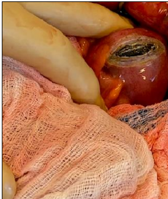
Figure 2: Vue opératoire montrant un calcul enclavé après la colotomie

without colostomy. The fistulous connection was identified but not treated to reduce the risk of complication (Figure 2).