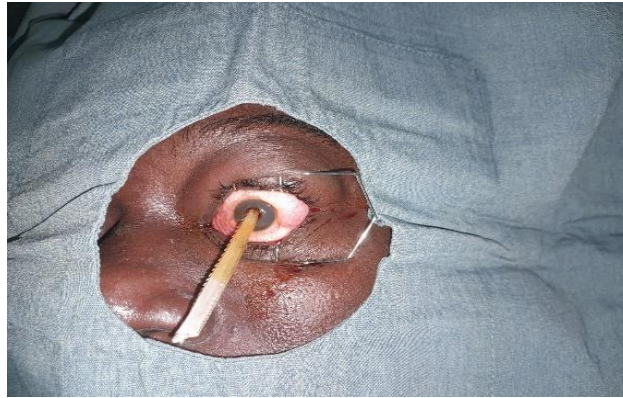
Figure 1: Foreign body by fish stop in a 35-year-old woman