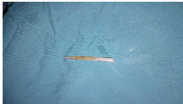
Figure 2: 10cm foreign body