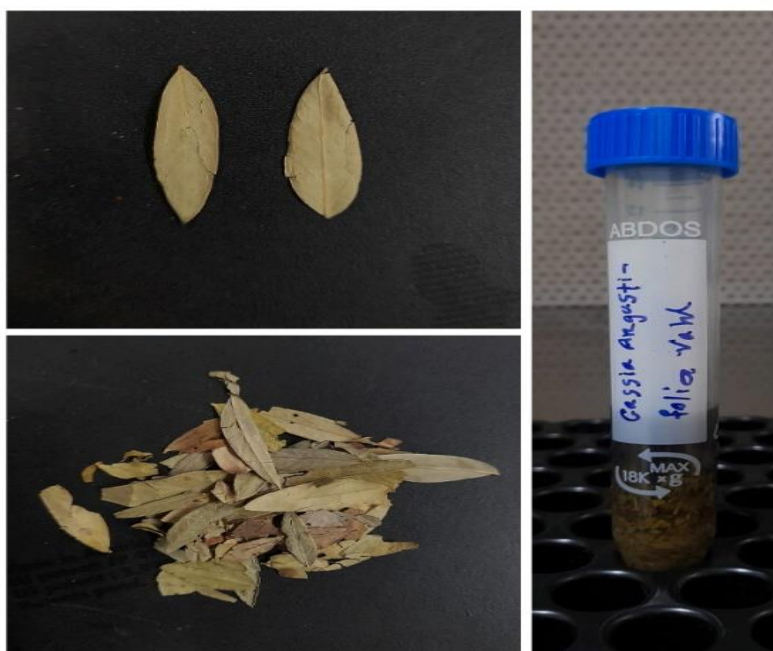
Figure 1: The Leaf of Cassia angustifolia and Ethanolic extract

amount of a-pinene . The dried leaves (Figure 1) were collected in the month of June, 2023. Then the dried leaves were packed separately in polythene bags and brought to the laboratory. The leaves were cut into small pieces by knife. The ethanol extract of the sample were obtained by the following procedure. For extraction 1g of the leaves was kept in 5ml of ethanol for 48hrs at room temperature. After that the extract was separated by centrifugation. The collected samples were centrifuged at 3,000 rpm for 10 minutes.