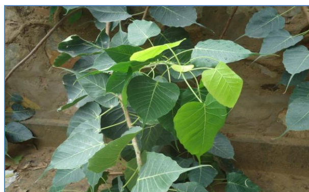
Fig-2: Plant of Ficus Religiosa Linn. (Peepal)

In Atharvaveda, it is declared that the divine forces of the third paradise dwell right now. Some accept that the tree houses the Trimurti, the roots being Brahma, the storage compartment Vishnu and the leaves Shiva. It has been venerated for quite a while. Lakshmi is additionally accepted to occupy the tree on Saturdays. In this way it is viewed as propitious to adore it. Ladies request that the tree favor them with a child tying red string or red fabric around its trunk or on its branches. The senior ladies in Hindu families have constantly revered Peepal because of its approval characteristics. Any individual who waters the tree is accepted to procure merit for his offspring, his distresses are recovered and infections restored. The peepal tree is additionally revered to escape from infectious illnesses and adversaries. To chop down a peepal is viewed as a wrongdoing equal to murdering a Brahmin, one of the five lethal sins or Panchapataka. As per the Skanda Purana, an individual goes to hellfire for doing as such.