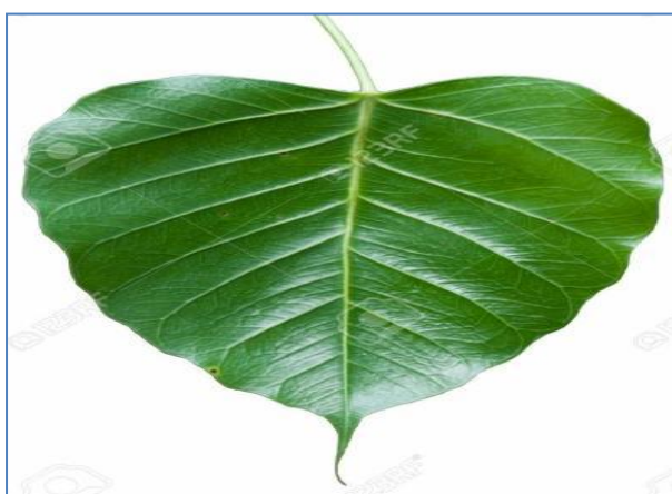
Fig-3: Ficus Religiosa Leaf