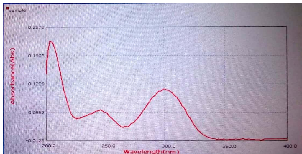
Fig-2: UV spectra of atazanavir sulfate

From the standard stock solution 5 ml was transferred to 10 ml volumetric flask and diluting to 10 ml with 0.1 N HCl to get a concentration of 50 µg/ml. Working standard solution of atazanavir sulfate was scanned between 200-400 nm. The wavelength maximum exhibited for atazanavir sulfate was at 249 nm (Fig-2).