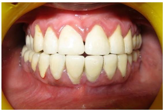
Fig-9: Post cementation view of protrusive-light contacts on anteriors and posterior disocclusion

The definitive crowns were cemented (Fig 9) with luting Glass Ionomer Cement (Type I GIC, GC, Fuji) after a two week follow-up and intra oral occlusal adjustment was done using 12\mu metallic articulating paper (Arti-Fol, Bausch) as it possesses good color transfer (unlike the conventional shim-stock) and high spots can easily be detected, especially on ceramic. The patient was placed on a maintenance recall of 3 months initially for assessment of hygiene and periodontal health.