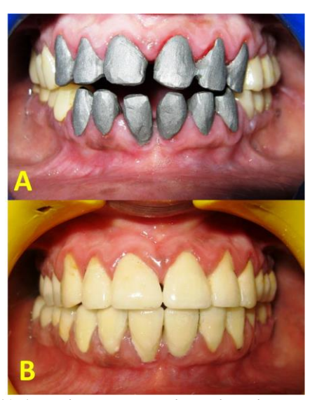
Fig-6: A) Anterior metal-coping trial with posterior provisional restorations in place and B) Anterior definitive crowns (Anterior guidance established first)

After confirmation of painless functioning, the anterior provisionals were removed and final tooth preparations were done. Gingival retraction (Ultrapak, Ultradent Products Inc., South Jordan, Utah and United States) and impressions were followed by bite registration while the posterior provisionals remained in place to maintain the bite. Metal ceramic crowns were fabricated (Fig 6A and 6B) for the maxillary and mandibular anteriors and cemented with provisional cement (RelyX Temp NE, 3M ESPE, United States).