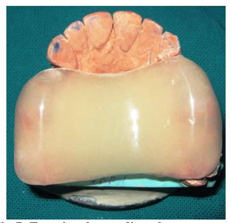
Fig-7: Functional recording plate to capture functionally generated path

Mandibular posterior temporaries removed and teeth were prepared for final crowns. The mandibular posterior PFM crowns were cemented provisionally (Rely X Temp NE, 3M ESPE). A Functional recording tray was fabricated in self cure clear acrylic resin over Maxillary posterior prepared dies. The tray loaded with Aluwax (Aluwax, Michigan, United States) inserted in the mouth and patient is asked to perform functional mandibular movements (Fig 7). A functionally generated impression of mandibular posterior teeth is recorded in Aluwax which was poured to get functional core (functionally generated pathway). This functional core is sectioned into right and left posterior parts which were later articulated on verticulator with its corresponding and opposing master cast dies (verticulator allows only up and down movement) (Fig 8A and B). The ceramic build-up on maxillary posterior teeth completed on the verticulator using functional core as a guide. Maxillary posteriors contoured with such technique would be most compatible to the various functional movements of mandible.