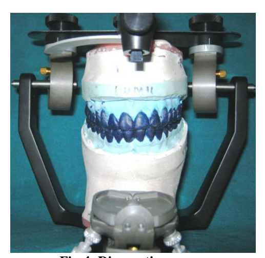
Fig-4: Diagnostic wax-up