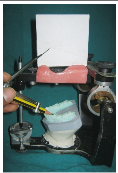
Fig-5: Occlusal plane analyzed using Broadrick Flag