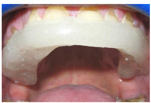
Fig-3: Occlusal splint on maxillary teeth

using bite registration elastomer (Futar D Fast, Patterson Dental Supply, Minnesota, United States). Mandibular cast was mounted using interocclusal records. An acrylic stabilization splint was fabricated on a duplicated maxillary cast to the proposed vertical dimension and the patient was asked to wear it for 3 weeks (Fig. 3). Meanwhile, a diagnostic wax-up (Fig. 4) was made to serve as a blue-print for the provisional restorations. The provisionals were fabricated from putty indices (Aquasil, Dentsply, Gurgaon, India) of the diagnostic wax-up. The posterior occlusal plane was established with an indigenous Broadrick flag stabilized in acrylic resin [5] (DPI RR cold cure, Mumbai, India) (Fig.5). The provisional restorations (Protemp Plus, 3M ESPE, United States) were cemented with Zinc Oxide Non-Eugenol temporary cement (RelyX Temp NE, 3M ESPE, United States) after minimal preparation of teeth. The patient was left to function with provisionals for 6 weeks.