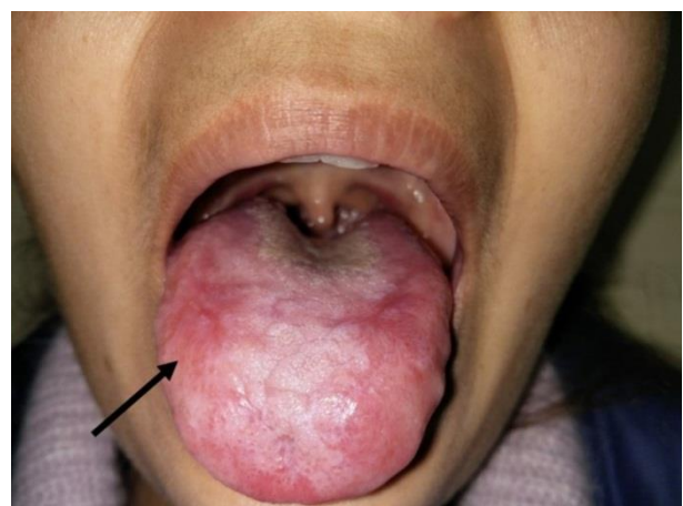
Fig-4: After 6 weeks of treatment black arrow shows only few residual types of erosion