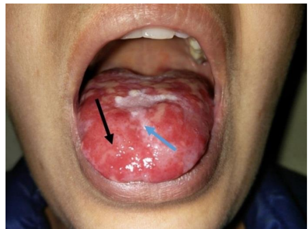
Fig-3: After three weeks of treatment erosions are reduced

Findings were consistent with Oral Lichen planus. Patient was started on topical steroids and tacrolimus. Dapsone in a dose of 100 mg was added along with symptomatic local anaesthetic benzocaine. Patient showed improvement at three weeks [Figure 3], topical steroids were discontinued while she was continued on daily dose of Dapsone and topical tacrolimus. At 6 weeks there was marked improvement as shown in figure (Fig-4).