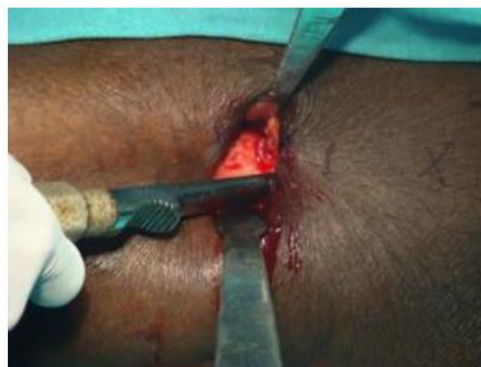
Fig-5C: Periosteum is elevated