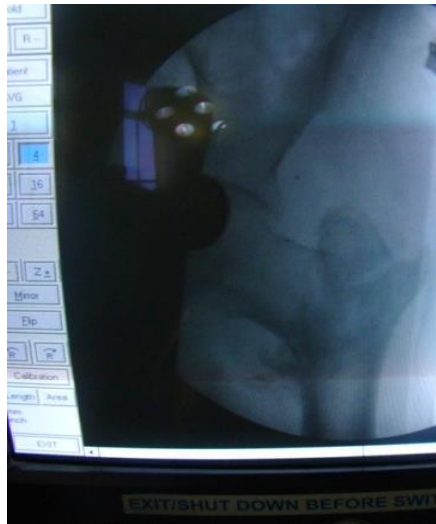
Fig-1: Fracture reduced by closed manipulation