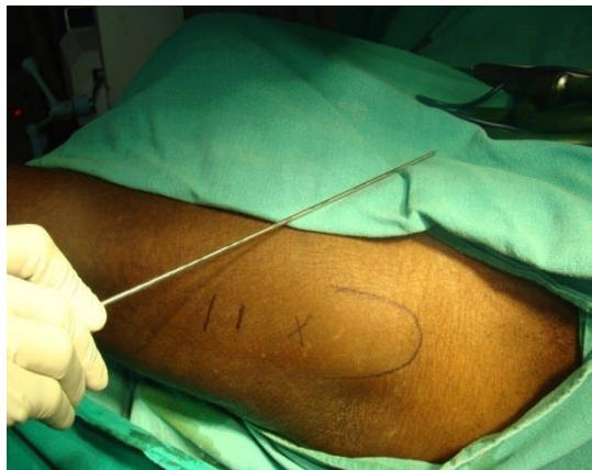
Fig-2: Marking of Greater Trochanter and Placement of Wire with entry point being marked