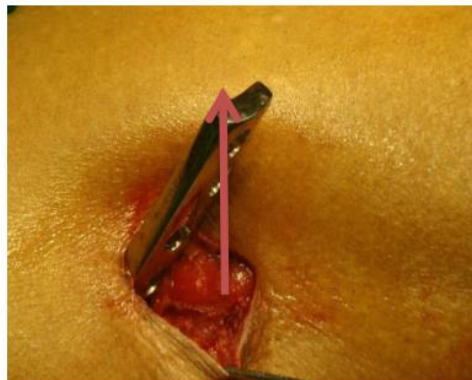
Fig-5F: Plate slided, perpendicular to bone