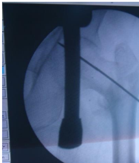
Fig-3: Central Position of guide wire