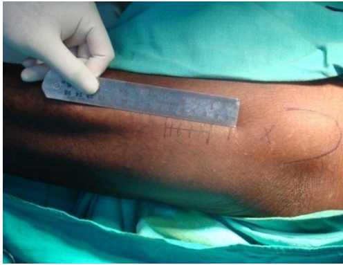
Fig-4: The skin incision given extending distally upto 4 cm from entry point