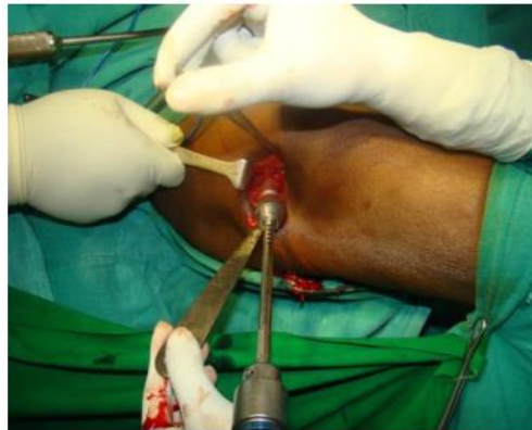
Fig-5E: Triple reamer over guide wire