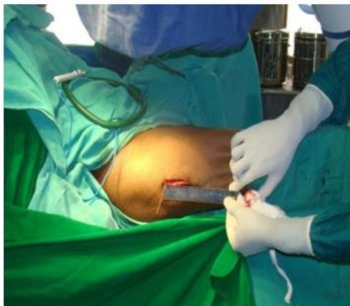
Fig-5A: 4 cm vertical incision