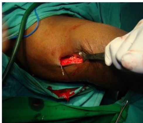
Fig-5G: Plate slided in with the help of retractor which retracts the skin inferiorly thereby pushing the plate inside