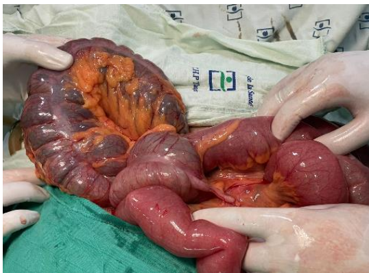
Figure 2: Cecum folded on itself