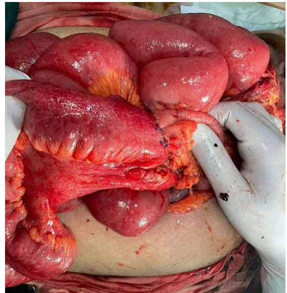
Figure 4: Manual ileo transvers anastomosis