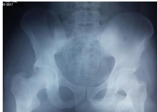
Fig-2B: Radiography of the pelvis face after reduction of dislocation, the patient was treated orthopedically