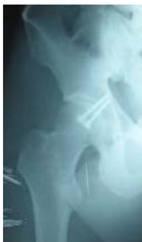
Fig-3B: postoperative control, screw-in treatment