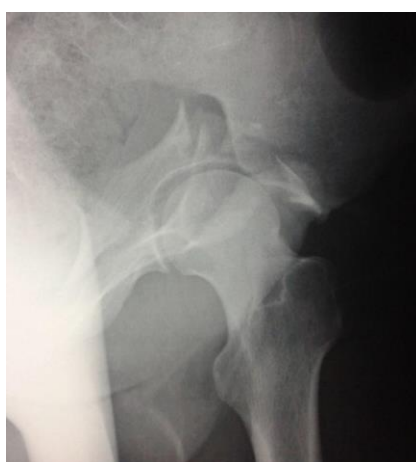
Fig-4A: X-ray of the pelvis showing a transverse fracture of the right acetabulum