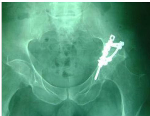
Fig-4B: Control X-ray after treatment with double anterior and posterior approach