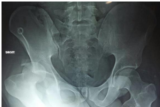
Fig-2A: Posterior hip radiograph showing posterior wall fracture associated with dislocation of the femoral head