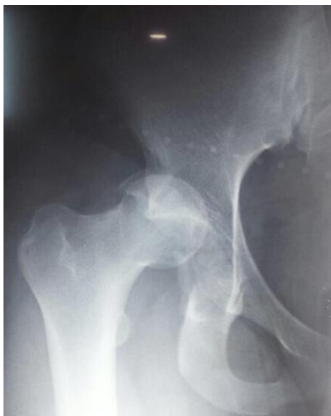
Fig-3A: pelvis radiograph showing fracture dislocation of the posterior wall