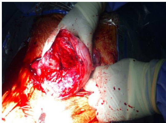
Fig-1: Large uterine rupture in fundal region