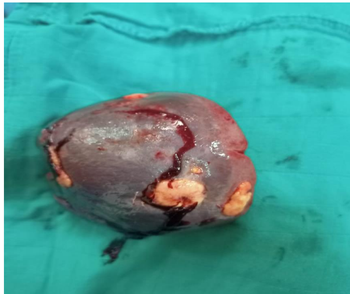
Figure 2: Operating unit (splenectomy)