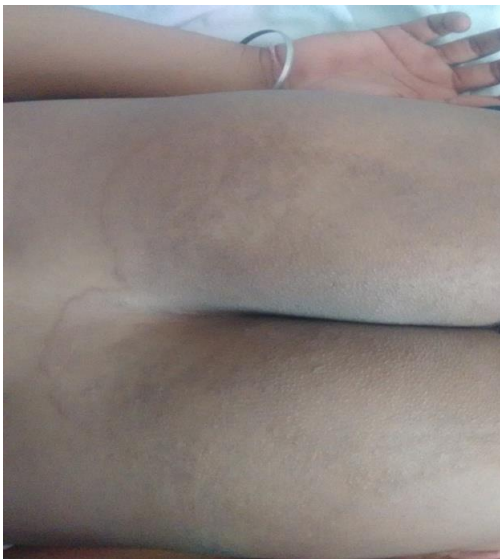
Fig-9: 2 Week- Grade 2 Response