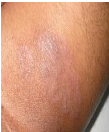
Fig-3: 4 th Week- Grade 3 Response