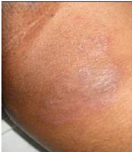
Fig-2: 2 nd Week- Grade 2 Response