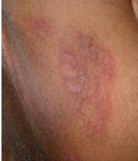
Fig-1: 0 Week- Before Treatment