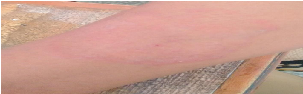
Fig-6: 2 nd week-grade 2 response