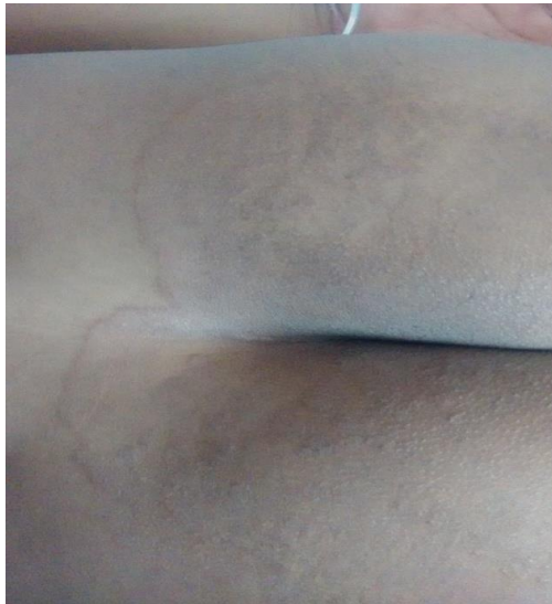
Fig-8: 0 Week- Before Treatment