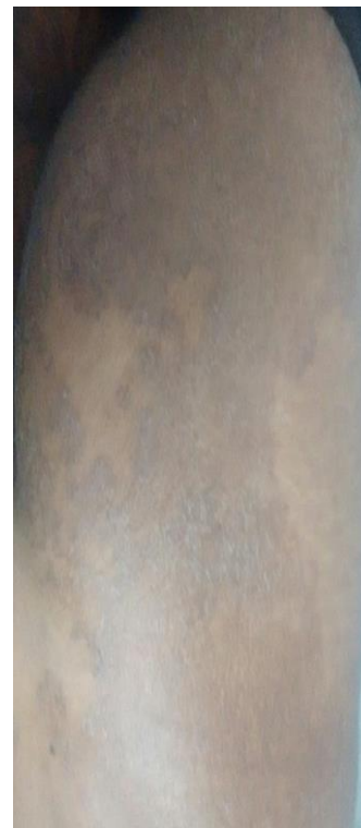
Fig-13: After Treatment