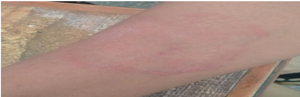
Fig-5: 0 week -before treatment