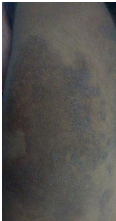
Fig-12: Before Treatment