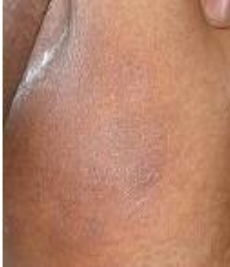
Fig-4: 6 th week- Grade 4 Response