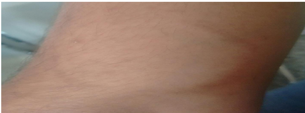
Fig-7: 4 th week-grade 4 response