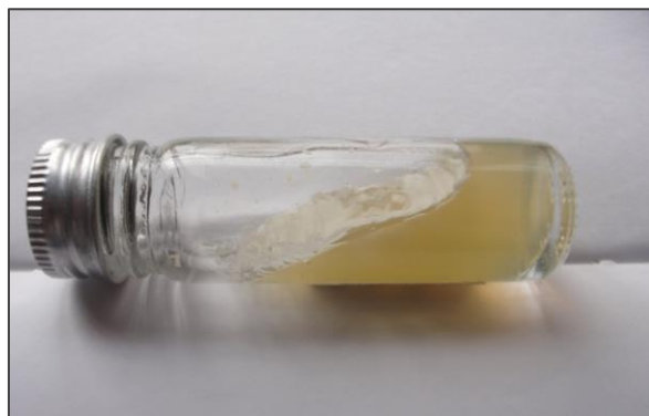
Candida albicans on culture media

species as the second most common. In our study, Candida species were found in 10 patients (13.9%) all of which were Candida albicans .