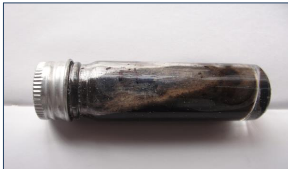
Aspergillus niger on culture media