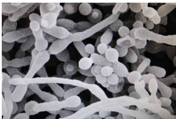
Candida albicans on photo microscopy