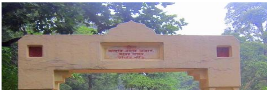
Plate-4: Chatim Tala, Santiniketan; Example of Yoga-Geographical ideas That means the Lord is the rest of his heart, pleasure of his mind and peace of his sole.

"Tini-i amar praner aram, Moner ananda, Atmar santi" - Maharsi Debendranath Tagore.