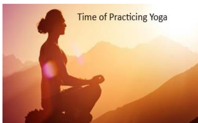
Plate-2: Time of Practicing Yoga

To establish the relationship between body and mind properly, the time and space is very crucial as follows-