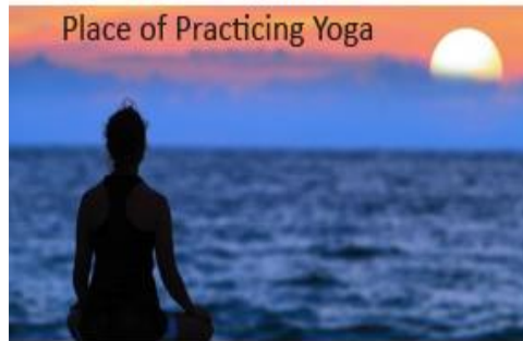
Plate-3: Place of Practicing Yoga [8]

Yoga Nidra can be done at any time of day, even directly after meals so long as people do not fall asleep in the practice. Yoga Nidra should not be practiced when anybody feel tired or sleepy. More will be gained when people are both awake and relaxed [1].