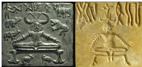
Plate-1: (Basavareddi, 2015) [1]

Suryanamaskara Historical evidences of the existence of Yoga were seen in the pre-Vedic period (2700 B.C.), and thereafter till Patanjali's period. The main sources, from which we get the information about Yoga practices and the related literature during this period, are available in Vedas, Upanishads, Smritis, teachings of Buddhism, Jainism, Panini, Epics, Puranas etc. A number of seals and fossil remains of Indus Saraswati valley civilization with Yotic motives and figures performing yoga indicate the presence of Yoga in India (Plate-1).