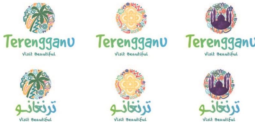
Fig-7: Final Secondary Design