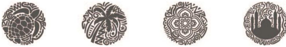
Fig-5: Design Consists