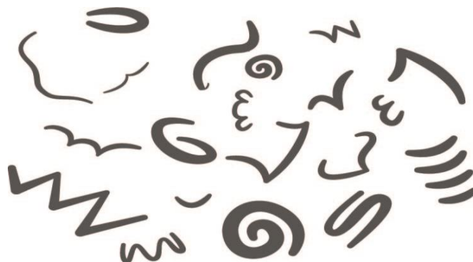
Fig-3: Sketch of the Geometric and Organic Shapes

This was followed by the the sketching of the geometric and organic shapes as seen in the image below;