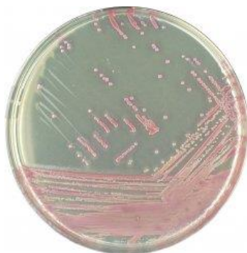
Fig-2: MRSA CHROMAGAR