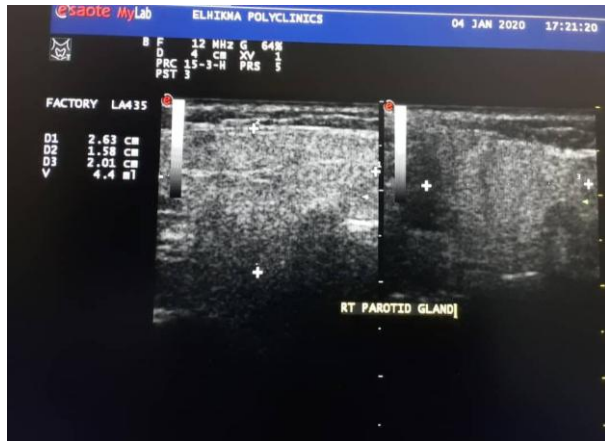
Fig-2: 24 years female, right parotid gland volume 4.4 ml (2.43x1.58x2.01cm)

Further studies should be done adding other patient's factors (height, weight, BMI) for more accurate results.