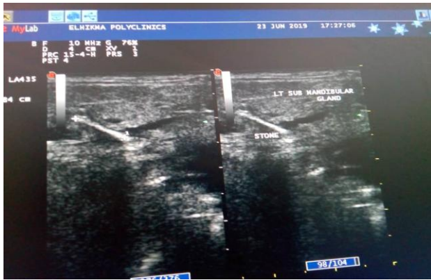
Fig-2: 25 years male with left submandibular sialolithiasis