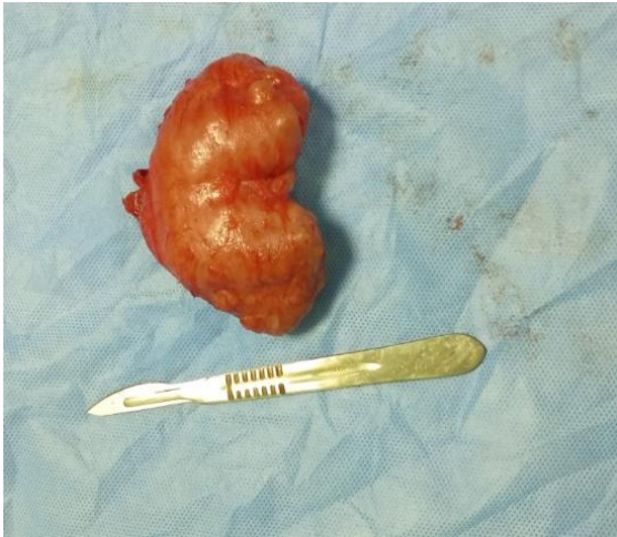
Figure 2: Posterior view of the enucleated specimen