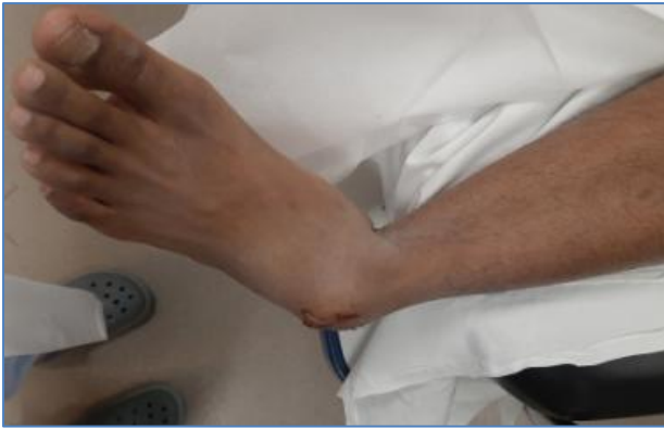
Fig-1: Physical exam findings for a medial subtalar dislocation.