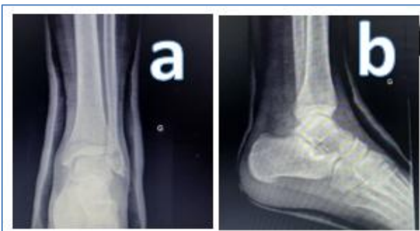
Fig-3: Postreduction radiographs demonstrating congruent of the subtalar joint.