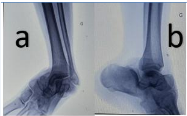
Fig-2: Injury radiographs demonstrating the posteromedial subtalar dislocation.