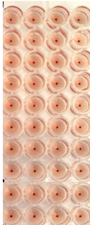
Fig-3: CONTROL EXPERIMENT