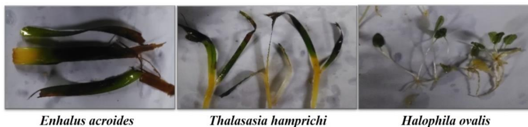
Fig-2: Seagrasses Species in Siput Island

The chart above explains that the composition of seagrass species around the waters of Pulau Siput Regency in the transect I were E. acroides by 80%, T. hamprichi by 60%, H. ovalis by 40%, with an average presence value of all species by 60.00%. In transect II, the composition were E. acroides by 60%, T. hamprichi by 60% and H. ovalis by 20%, with an average