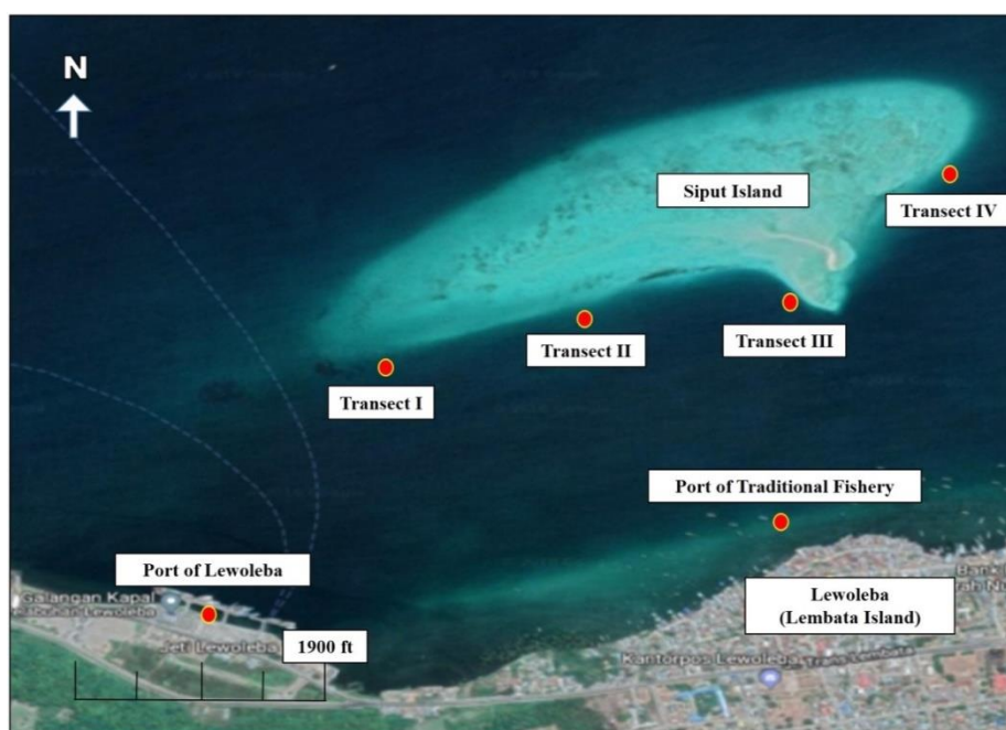
Fig-1: Location of The Study: Siput Island, Lembata, Indonesia

using the line transect method. Equipment and materials used in this study are GPS, digital cameras, transect quadrants, plastic samples, DO (dissolved oxygen) meters, pH meters, refractometers and thermometers.