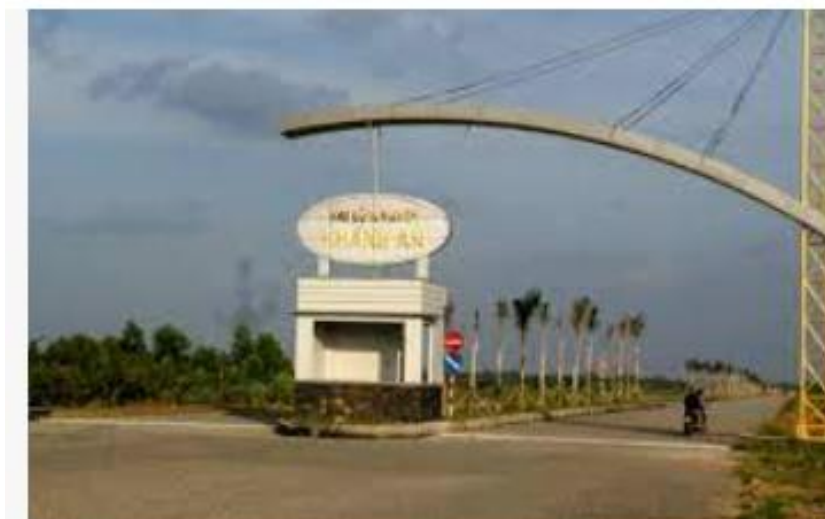
Figure 3: Develop industrial clusters in Cs Mau of Vietnam