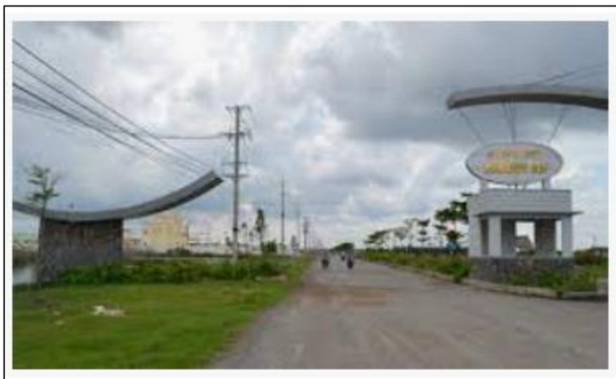
Figure 2: Khanh An industrial zone