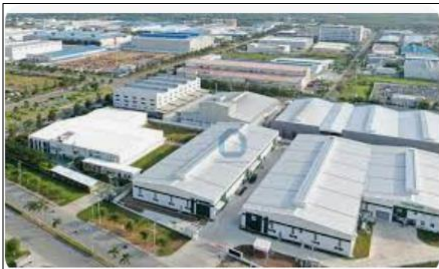
Figure 1: Ca Mau industrial zones