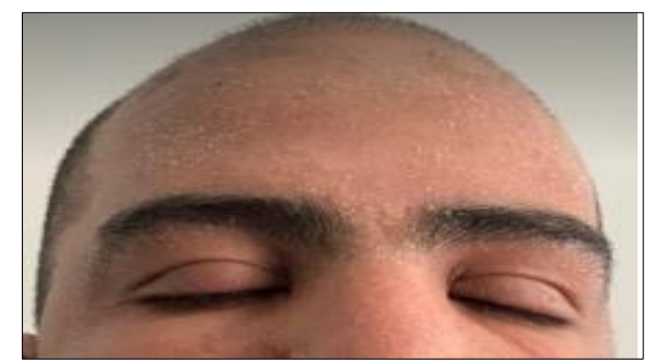
Figure 1: Clinical appearance of lesions