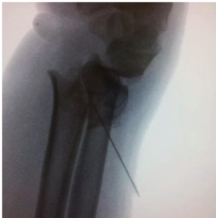
Figure 2: HB's X-ray indicates a fracture of the distal radius

with a needle, local anesthesia is given, and the hematoma is aspirated to verify the location. (Figure 2).