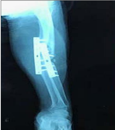
AP X-ray of the forearm showing eutrophic pseudarthrosis