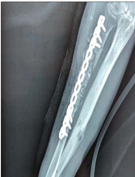
AP X-ray of the forearm showing eutrophic pseudarthrosis