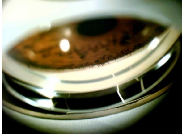
Figure 3: Gonioscopic images showing posterior embryotoxon with attached iris strands and peripheral anterior synechiae