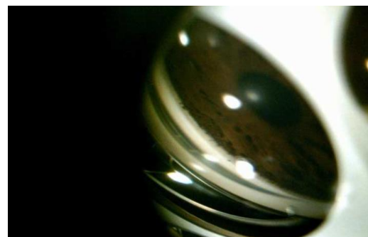
Figure 2: Gonioscopic images showing posterior embryotoxon with attached iris strands and peripheral anterior synechiae