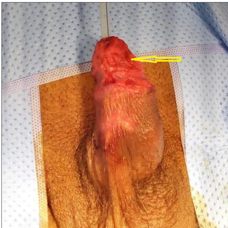
Figure 2 (b): The evolution was favorable with satisfactory healing of the penis.