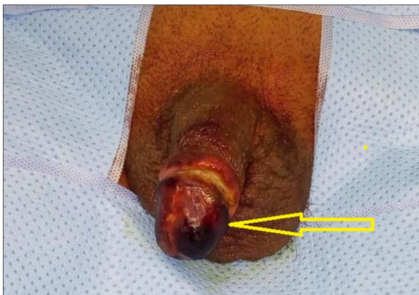
Figure 1: The digital lesions of calciphylaxis

Informed Consent: written informed consent was obtained from the patient for participation in our study.