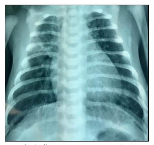
Fig 1: Chest X-ray taken on day 1

appearance, giant congenital lobar emphysema, diaphragmatic hernia, dextrocardia, and pneumonia are to be considered.