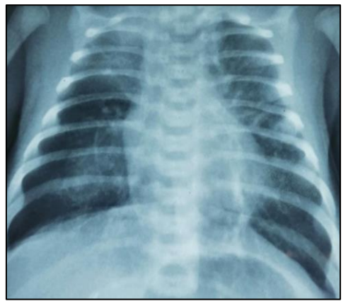
Fig 2: Second chest X-ray performed showing Overinflation and atelectasis of right upper lobe

At this stage, a thoracic computed tomography (CT) scan was necessary, revealing moderate parenchymal lobar hyperinflation leading to atelectasis