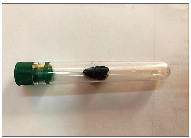
Fig 5: Foreign body (sunflower seed) removed

Endoscopic exploration showed the presence of a foreign body (sunflower seed) safely recovered (Fig 5), completely obstructing the upper left bronchial lumen with a slightly obstructive granuloma opposite, followed by aspiration of purulent secretions in sheets from the left lower lobe without residual fragment. Endoscopic control was satisfactory.