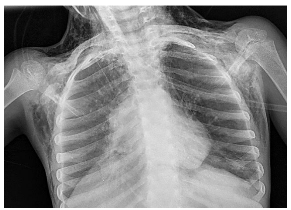
Fig 2: Frontal chest x-ray showing significant subcutaneous emphysema with pneumo-mediastinum

The chest x-ray confirmed the presence of air in the subcutaneous tissue with pneumomediastinum (Fig 2)