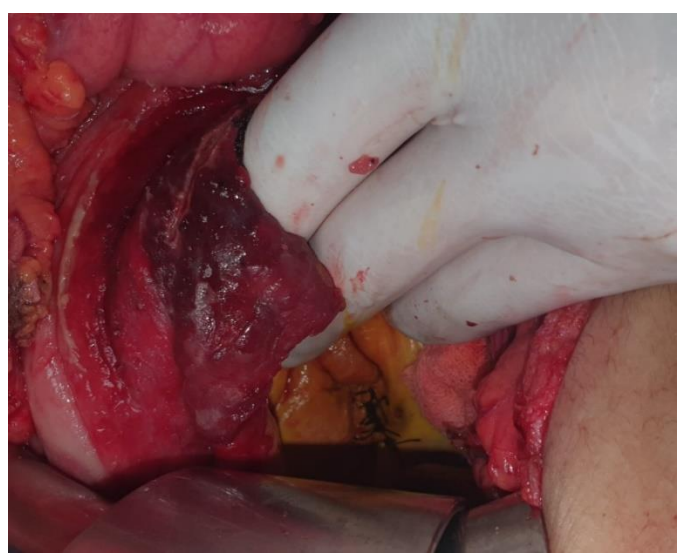
Figure 3: Closure of the biliary fistula using sutures