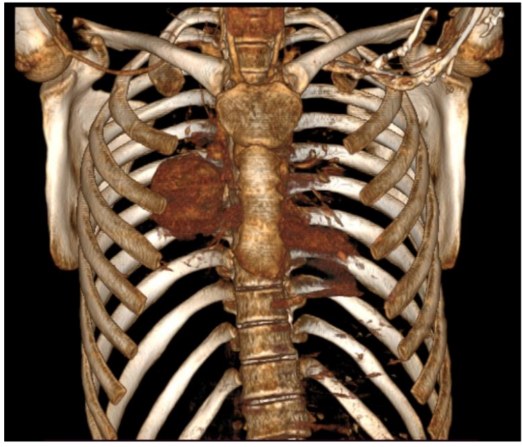
Figure 3: Reconstruction sections showing multiple pulmonary artery aneurysms and their dividing branches