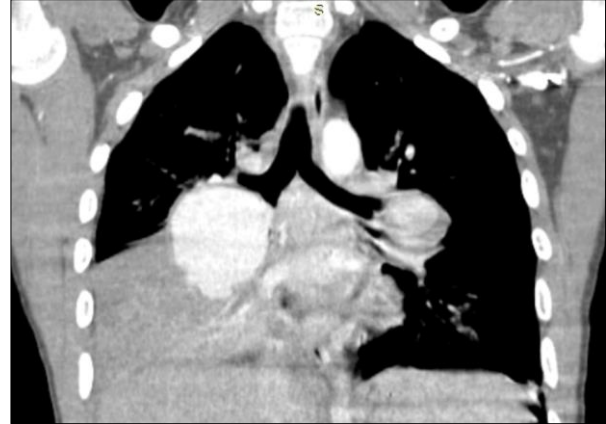
Figure 1: Objective thoracic angioscanning of saccular aneurysms depending on the arterial branches of the dorsal segment of the LSD and at the level of the two intermediate trunks