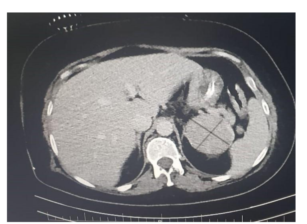
Figure 2: Cross-section of abdominal CT scan showing adrenal pheochromocytoma measuring 59*59mm

with regular tissue contours and homogeneous enhancement, measuring 59*59 mm.