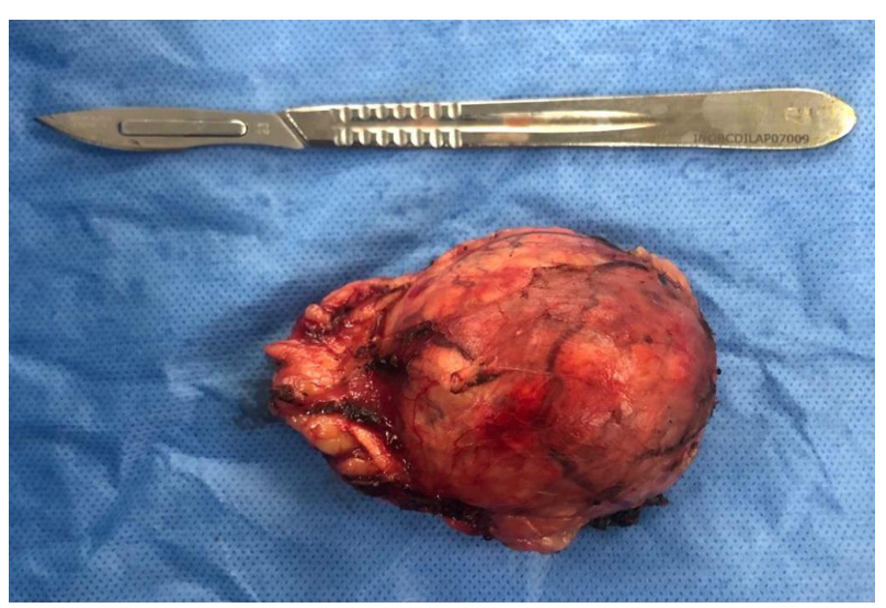
Figure 3: A section of the dissected pheochromocytoma

treatment and progressive respiratory weaning, with good progression, before being transferred to the surgical oncology department. A left adrenalectomy removing the tumor was performed without complications. Pathological examination confirmed a benign pheochromocytoma. The evolution was favorable.