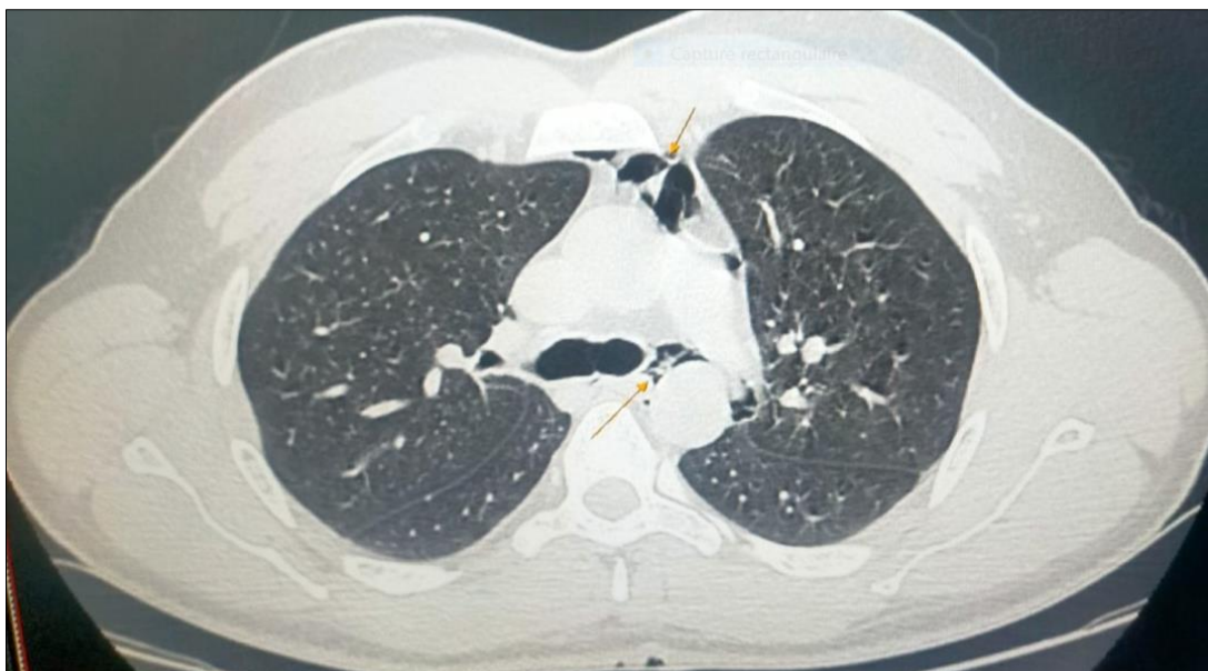
Figure 2: CT scan confirmed the pneumomediastinum with the presence of radiological signs in favour of Boerhaave syndrome.

An additional CT scan confirmed the pneumomediastinum with the presence of radiological signs in favour of Boerhaave syndrome (figure 2)