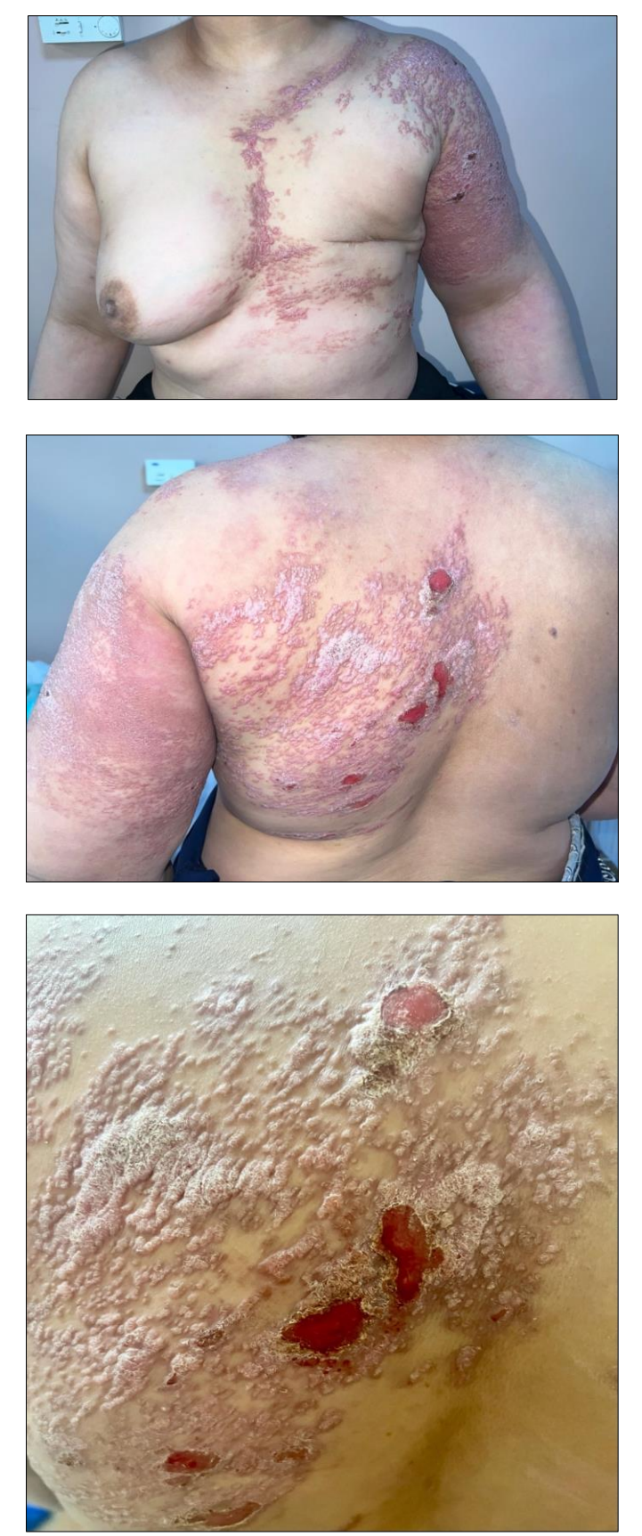
Figure 1, 2, 3: Zosteriform cutaneous metastases mimicking varicella-zoster virus infection on the chest, abdomen and left limb of a woman previously treated for an invasive ductal carcinoma of the left breast)