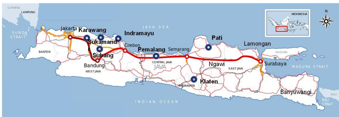
Fig-1: Location map of Brown planthopper origin (blue circle) of West and Central Java. Indonesia

BPH population were gotten from IR42, Ciherang, Mekongga, Inpari 16, because those varieties were damaged by BPH, especially on the three early mentioned that released at years of 1980, 2000, and 2004 respectively showed heavy damaged.