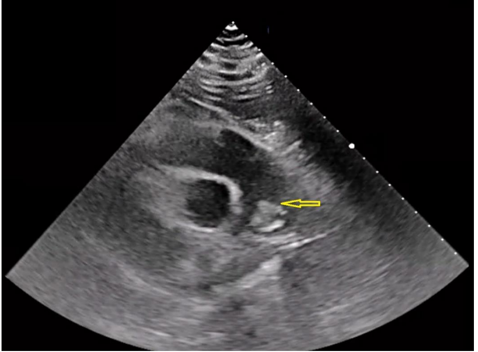
Figure 2: Echocardiogram

The arrow indicates the pulmonary embolism