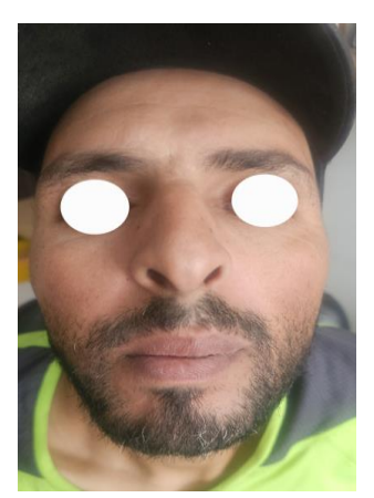
Figure 6: Clinical image of the patient 1 year follow up

No other postoperative complications were noted (Figure 6 & 7).