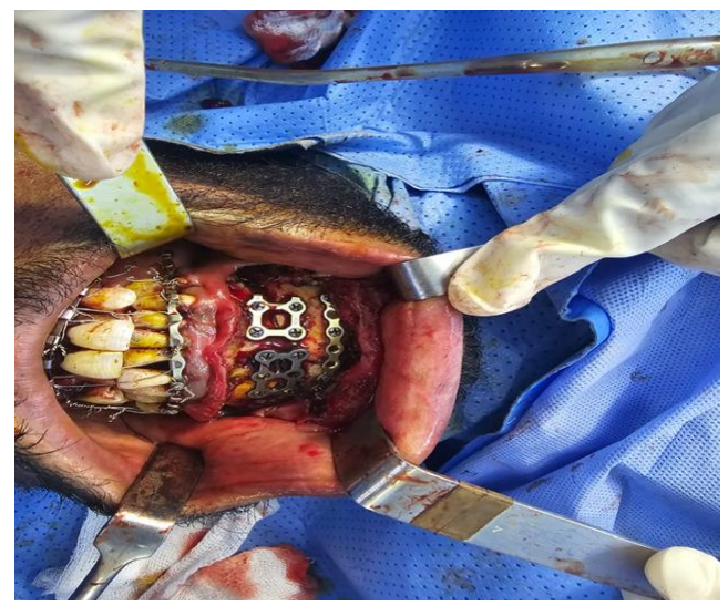
Figure 4: Intraoperative image showing open reduction and internal fixation of horizontal mandibular fracture

A soft diet was recommended, Analgesics and antibiotics were prescribed pre and post op, and the patient was instructed to gargle with chlorhexidine