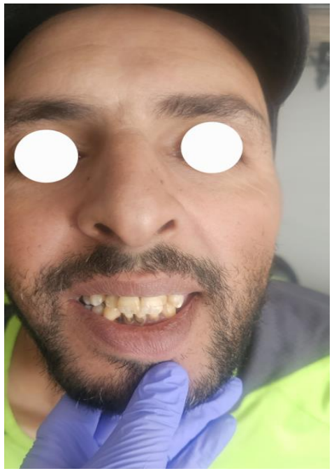
Figure 7: Clinical image of the patient 1 year follow up