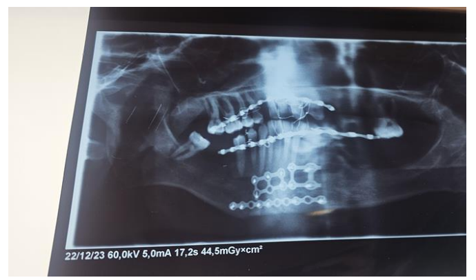
Figure 5: Image showing post op orthopantomogram

mouthwash for a month. before discharging the patient (2 days post op) we took an orthopantomogram (Figure 5).