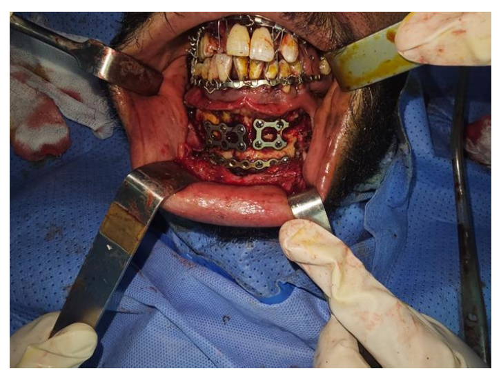
Figure 3: Intraoperative image showing open reduction and internal fixation of horizontal mandibular fracture

The fractured fragment was reduced to the anatomical position and was fixed using 2 three-dimensional (3D) plate in the symphysis region and a single 10 holder maxiplate over the lower border at the ends of the fracture line. Closure was then accomplished using 3-0 absorbable polyglactin sutures (Figure 3 & 4).