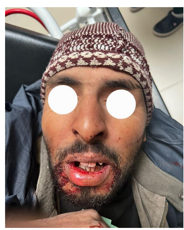
Figure 1: Image showing the clinical presentation of the patient

associated with a limited mouth opening with occlusal derangement (Figure 1).