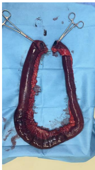
Figure C: Photo shows necrotic intestinal handles