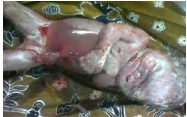
Fig-2: Macerated still born fetus

She also was a hypothyroid since last 2 years and was on medication. She also had a history of diarrhea and vomiting for 5 days. According to LMP her EDD was on 9 th September, 2019