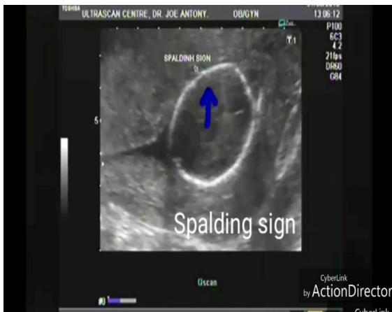
Fig-4: USG Showing spalding sign of skull bone