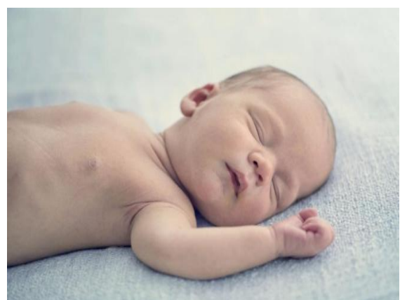
Fig-3: Fresh still born baby

Another 25 years old second gravida was hospitalized at her 39 weeks of pregnancy with absence of fetal movement for 1 day. She had lower abdominal pain for 4 hours. No fetal heart sound was audible with Doppler machine after admission. Ultrasonogram was done immediately that revealed intrauterine death, hence was diagnosed as a case of intrauterine fetal death of 37 weeks of maturity. On abdominal examination uterus was about full term in size with cephalic presentation and head was engaged, hence diagnosed as second gravida 39 weeks of pregnancy with IUFD with unexplained etiology.