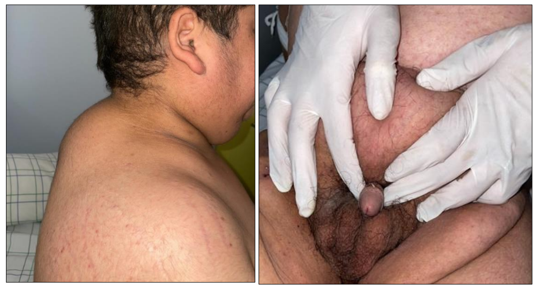
Figure 2: Buffalo hump, acanthosis nigricans, purple stretch marks on the root of the right upper limb, and micropenis in a patient with Cushing's syndrome.