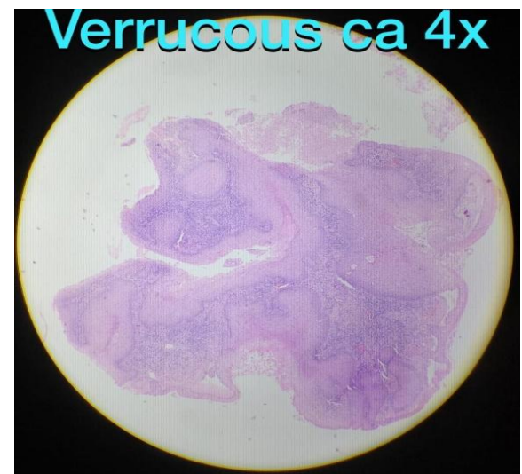
Fig-2: Sections showing features of Verrucous carcinoma [H7E, 4x]