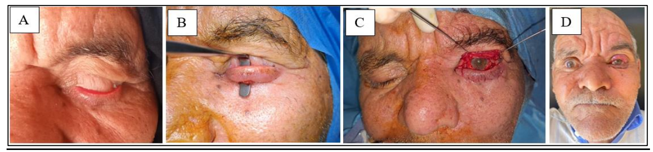
Figure 3: flap weaning A and B: flap appearance after 6 weeks C: individualization of the 2 anterior and posterior flaps D: local condition at d3 postweaning