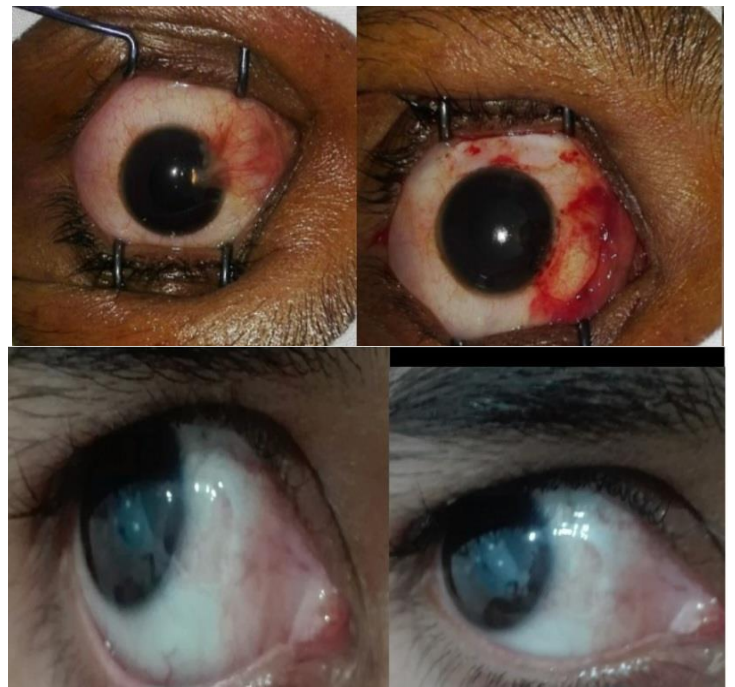
Figure 1: Nasal pterygium before & after surgery, after 1 month & after six months (Graft taken from superior conjunctiva)

B, which was not statistically significant. Graft retraction in Group A was in 10 eyes & 12 in Group B, which was not statistically significant. Other findings are almost similar in both groups.